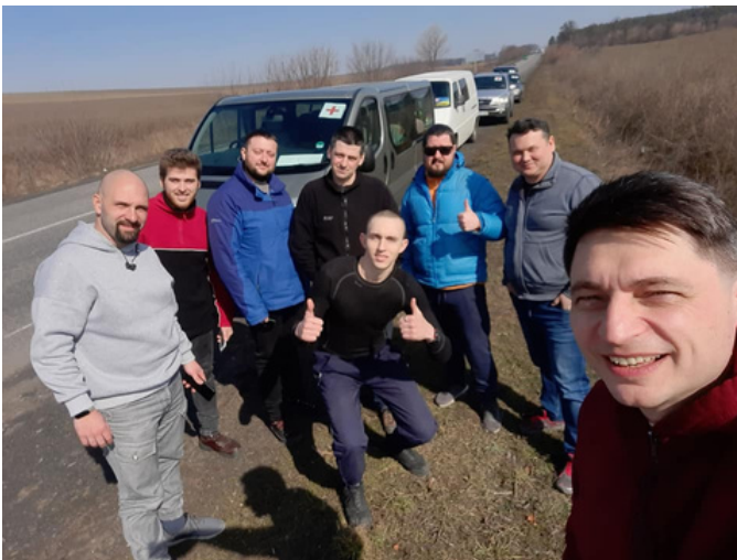
Leaders of Cherkassy church taking food supplies to the front line towns and cities in the east and evacuating people.